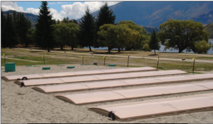
This array of AX-Max units provides wastewater treatment for a large resort and camping area in New Zealand.